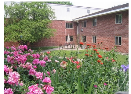
A view from the garden at Juniper Manor.

Juniper Manor is a 40 unit apartment building that provides safe and affordable housing for seniors in Trumansburg. The building originally became a ReBusiness Partner in 2009. Staff conducted a re-assessment in early 2018 that examined practices for collecting single-stream recycling, additional recyclables, and food scraps. A report provided recommendations on how to improve these practices from a 4R (reduce, reuse, recycle, and rebuy) perspective, saving money and resources. The program also provided the building with new recycling bins, standardized waste sorting signs, and kitchen caddies for collecting food scraps in individual apartments. Would your business benefit from a free waste assessment? Contact Seth Dennis at sdennis@tom-pkins-co.org today to learn about becoming a ReBusiness Partner.