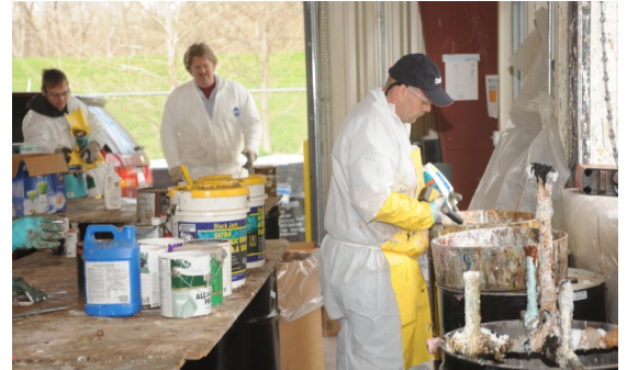
Clean Harbors workers sort paint for recycling.

The Environmental Protection Agency considers leftover household products that can catch fire, react or explode in certain conditions, or are corrosive or toxic to be household hazardous waste (HHW). These products should not simply be placed in the trash or poured down the drain because they pose significant dangers to human and environmental health. They also shouldn't be stored indefinitely. They can pose risks to children and pets and should be monitored regularly for leaking. Take steps this year to dispose of your HHW properly at an HHW collection event at the Recycling and Solid Waste Center. A solid waste permit is required.