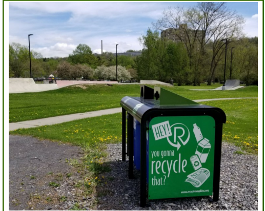
New Public Space Recycling bins were recently installed at the Wood Street skate park and the GIAC basketball courts in Ithaca.

Recycletompkins.org has been updated with a new look and tools designed to make proper recycling easy and convenient for all residents. The new “Find My Recycling Day” and “What Do I Do With” applications will help residents learn when and what to recycle with the option of creating a personalized collection calendar and setting up automated curbside pick up day reminders. The new website was developed by Flourish Design Studio in Ithaca.