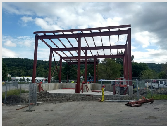
Pictured: Workers construct the metal frame of the food scraps transfer building at the Recycling and Solid Waste Center in late September.

Construction of a new food scraps transfer building began in July at the Recycling and Solid Waste Center in Ithaca. The pre-fabricated building will be ready to accept food scraps from commercial sources starting in early 2019, and will allow for the more efficient transfer of food scraps to Cayuga Compost in Trumansburg. The work is being completed by Elmira Structures, Inc, and is funded in part by a New York State Department of Environmental Conservation Climate Smart Communities Grant.