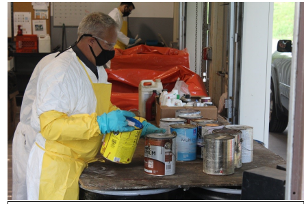
A Clean Harbors employee sorts paints and stains.

Getting rid of old paint, automotive care products, and other household chemicals requires careful handling and proper treatment. Fortunately, there are 6 Household Hazardous Waste (HHW) drop-off events scheduled for 2021. Make HHW a part of your spring cleaning or summer projects by signing up for the April 17th, May 15th, or July 17th drop off events. A valid solid waste permit and an appointment are required, visit RecycleTompkins.org/HHW to get started.