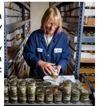
A Dairy One worker handling samples for agricultural testing services.

The newest business to go through the ReBusiness Partners Program is Dairy One Co-Op Inc., which is a not-for-profit cooperative of approximately 3,000 dairy farmers throughout the Northeast and Mid-Atlantic region. The cooperative's primary office and laboratory facilities are located in Ithaca. TCRMM staff worked with Dairy One remotely to conduct a free waste assessment and develop recommendations for improved waste management practices. Some of the recommendations included ways to divert food scraps and improve recycling practices in office settings. Visit RecycleTompkins.org/ReBusiness to learn more about the program.