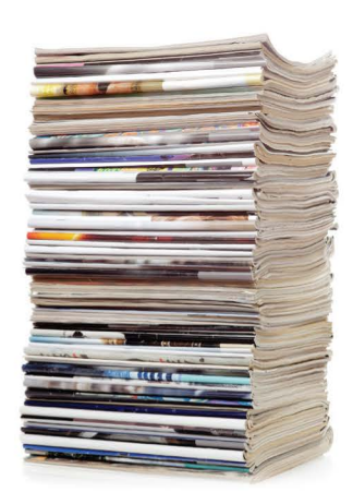
Mixed Paper & Cardboard