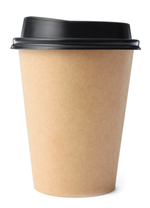
Coffee Cups and Lids