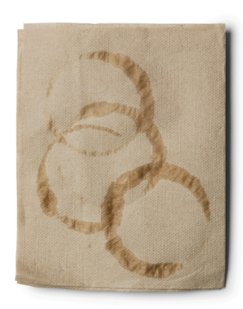
Paper Napkins and Towels