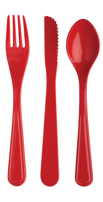
Utensils and Straws