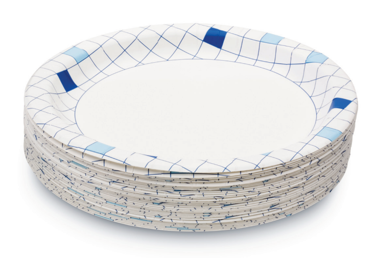
Paper Plates and Bowls