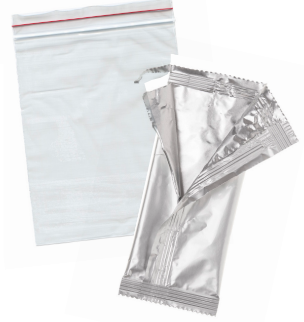
Plastic Bags and Wrappers