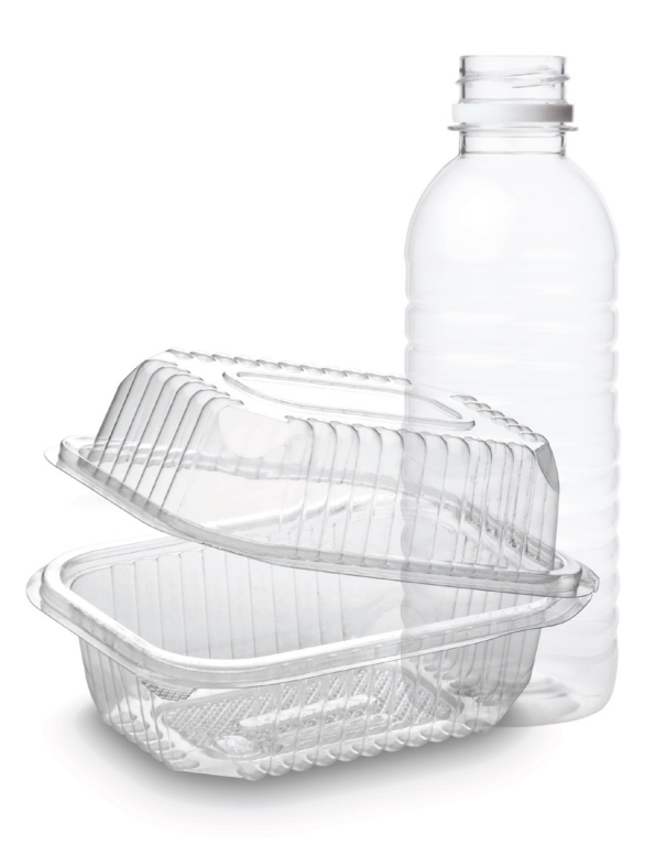
#1, 2, and 5 Plastic Containers