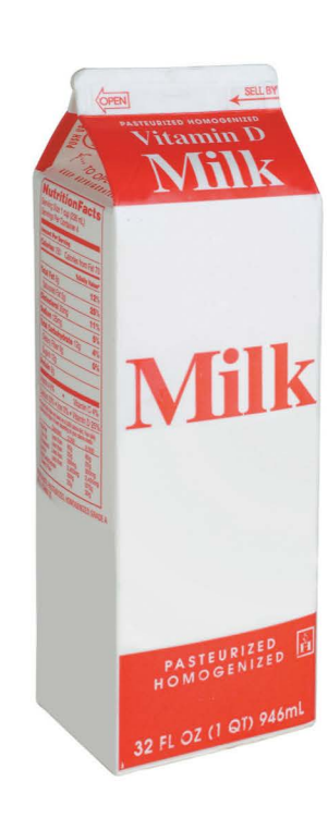
Paper Cartons and Drink boxes