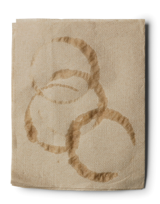
Paper Napkins and Towels