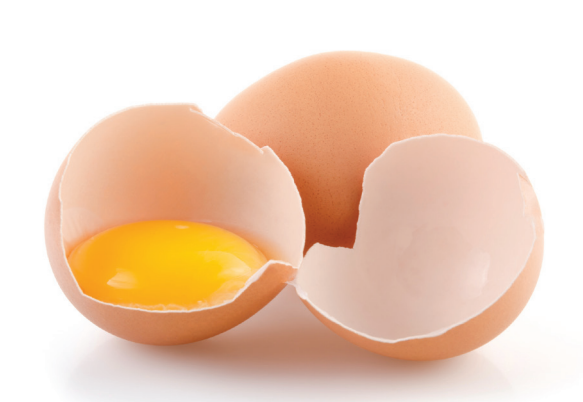
Eggs and Dairy