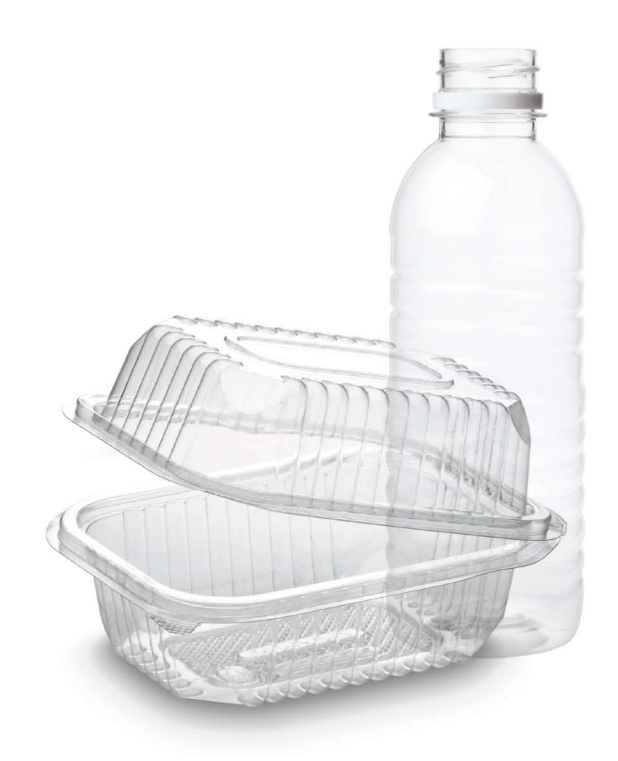
#1, 2, and 5 Plastic Containers