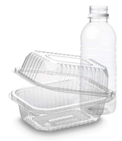
#1, 2, and 5 Plastic Containers