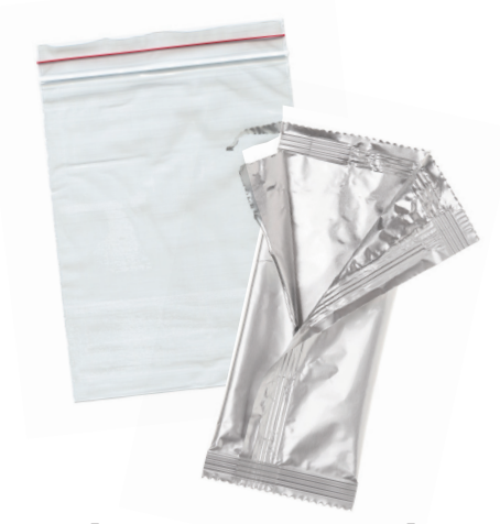
Plastic Bags and Wrappers