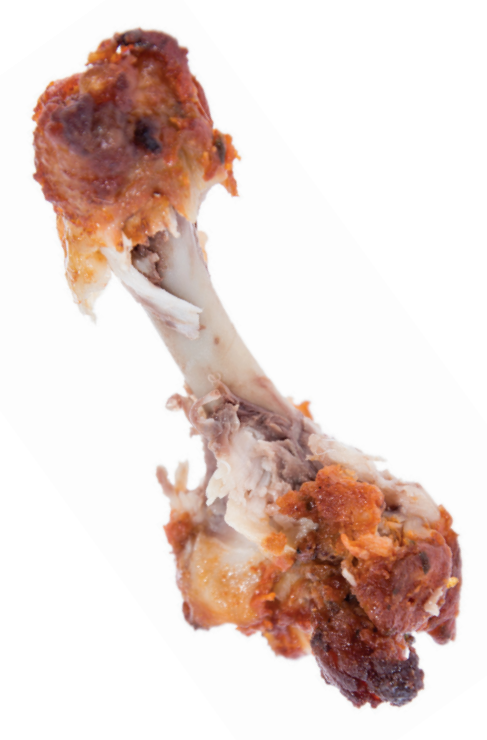
Meat and Bones