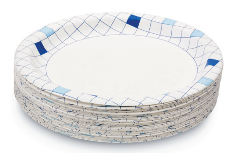
Paper Plates and Bowls