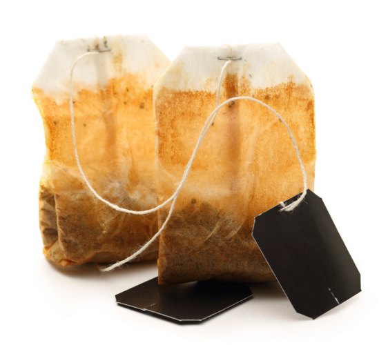
Coffee Grounds and Tea Bags