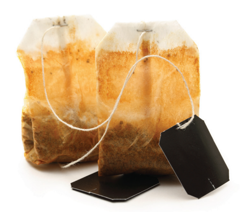
Coffee Grounds and Tea Bags