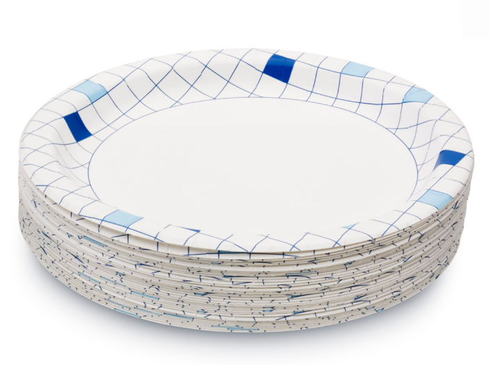
Paper Plates and Bowls