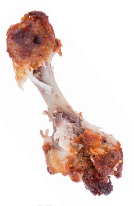
Meat and Bones