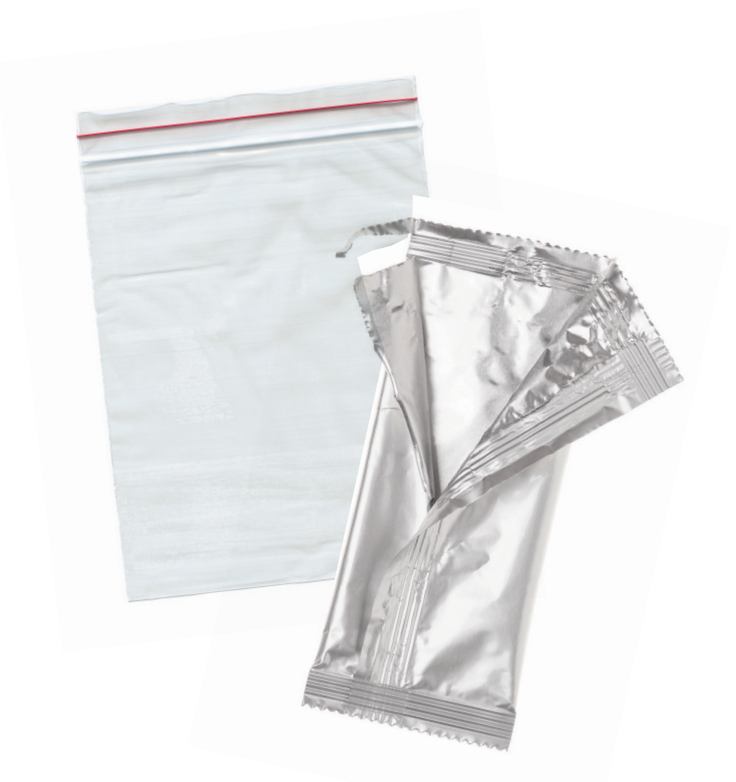
Plastic Bags and Wrappers