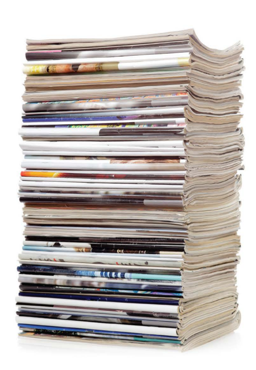
Mixed Paper and Cardboard