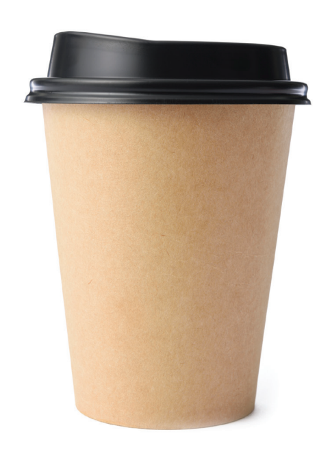
Coffee Cups and Lids