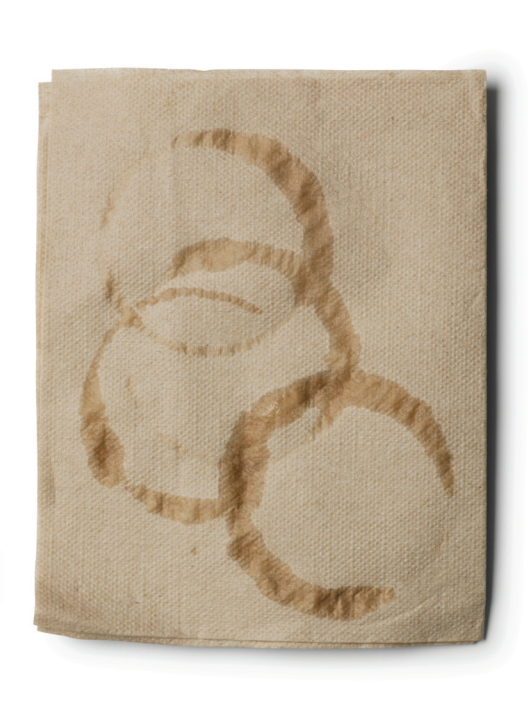
Paper Napkins and Towels