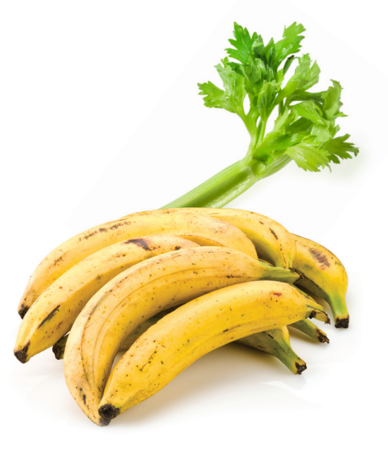
Fruits and Vegetables