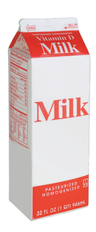
Paper Cartons and Drink boxes