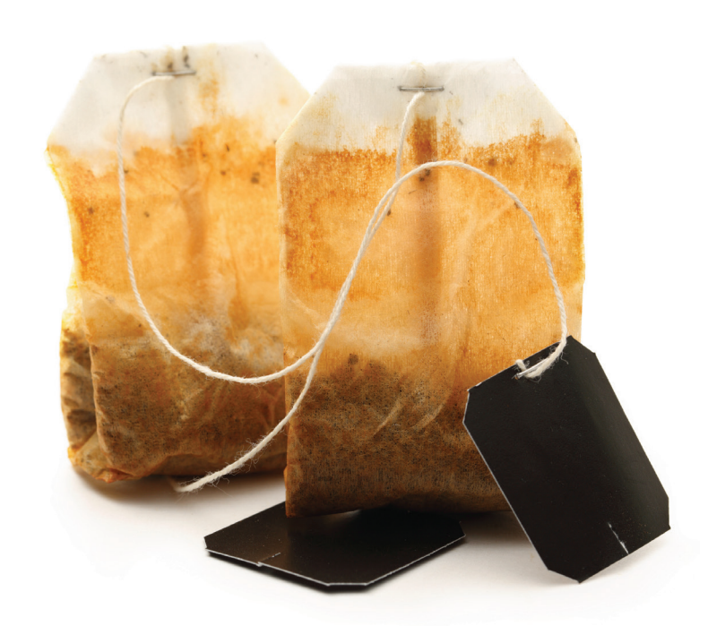
Coffee Grounds and Tea Bags