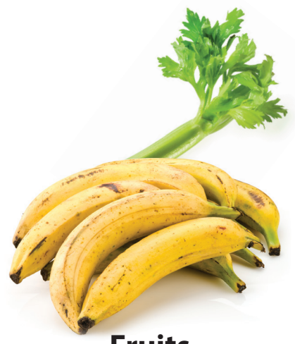
Fruits and Vegetables