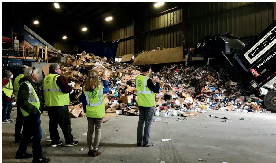
Tompkins County Recycling & Materials Management

To mark New York Recycles Day on Nov. 15, Tompkins County Recycling & Materials Management Department (TCRMM) hosted 19 participants for informational walking tours of the Tompkins County Recycling & Solid Waste Center (RSWC) in Ithaca.